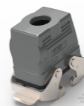
TE Part # T1710101125-000 H10B-TBFS-M25