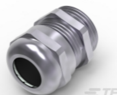
TE Part # T3609250112-000 DLX-25-MT