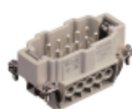
TE Part # T2040102101-000 HE-010-M